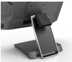
Arm type Barcode Scanner