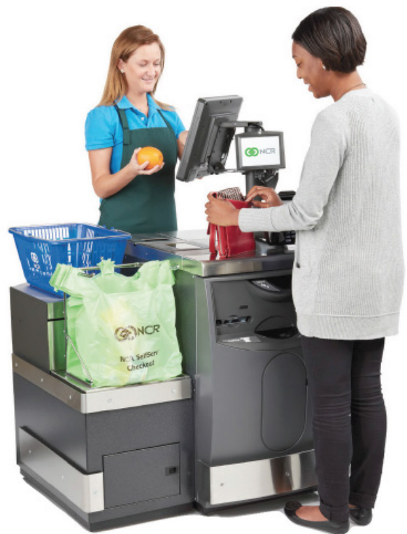
NCR FastLane SelfServ Release 5 Express Convertible